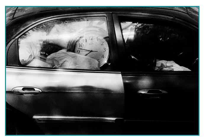
鐘 /Clock, 2021, 35mm film digital scanned