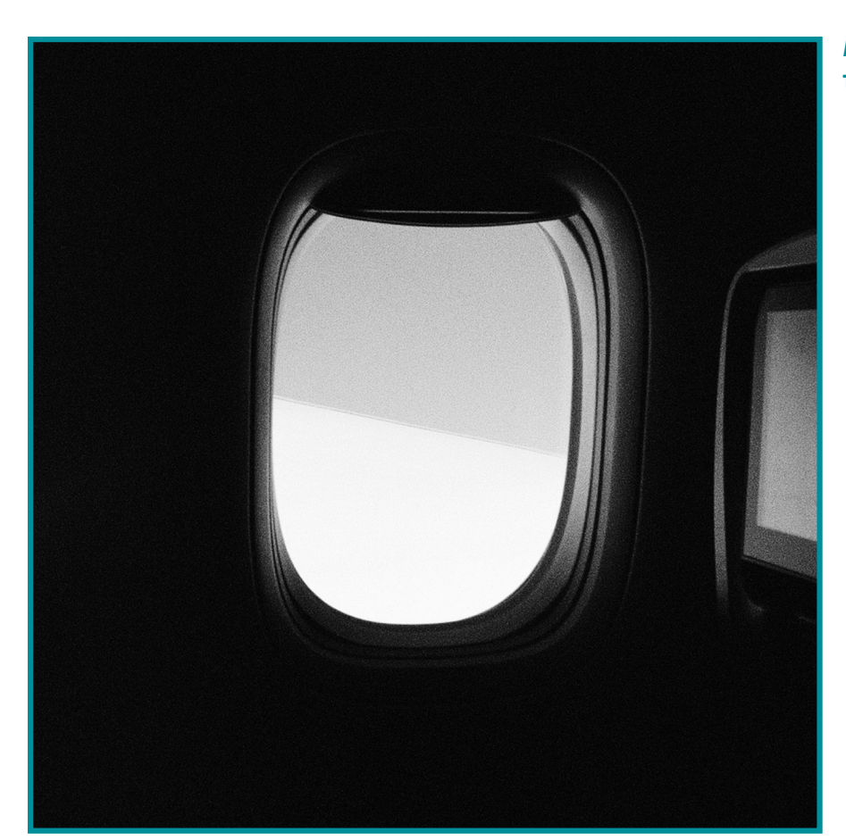
BR-17, 2020, Medium Format film digital scanned