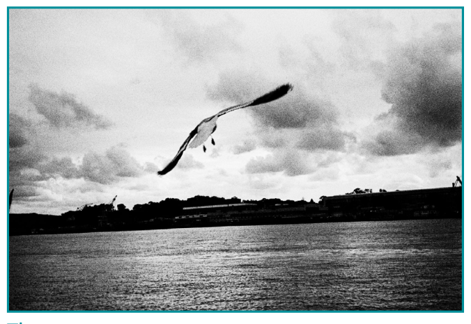
歐/Seagull, 2021, 35mm film digital scanned