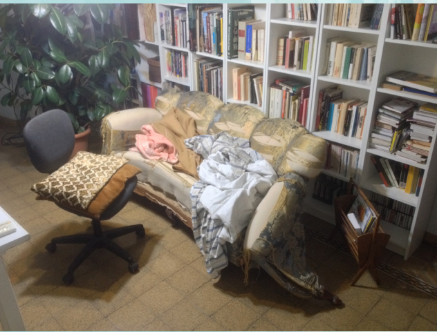
Gregory Blanche, original photograph of Deposition , 2021, 1_8 x 13 7_8, pencil on paper

An essential part of realism is working in perspective, which is a practice he loves to explore. Seeing the couch as a proxy for the body, Blanche styled and mocked up the photograph digitally in Photoshop, creating a pedestal for the piece. Drawing this image allowed Blanche to dedicate time to a three-point perspective to sink into a classical technique. Through attention to detail and care, he delicately shades with the edge of his graphite pencil.