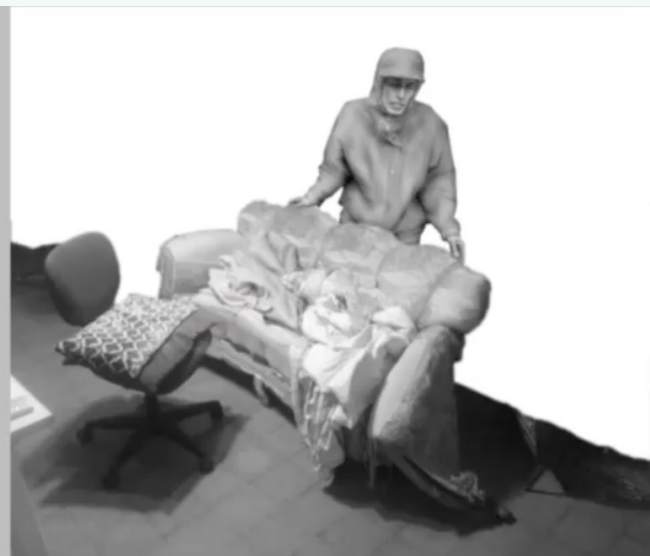
Deposition Study (sofa and nicodemus gray), Gregory Blanche