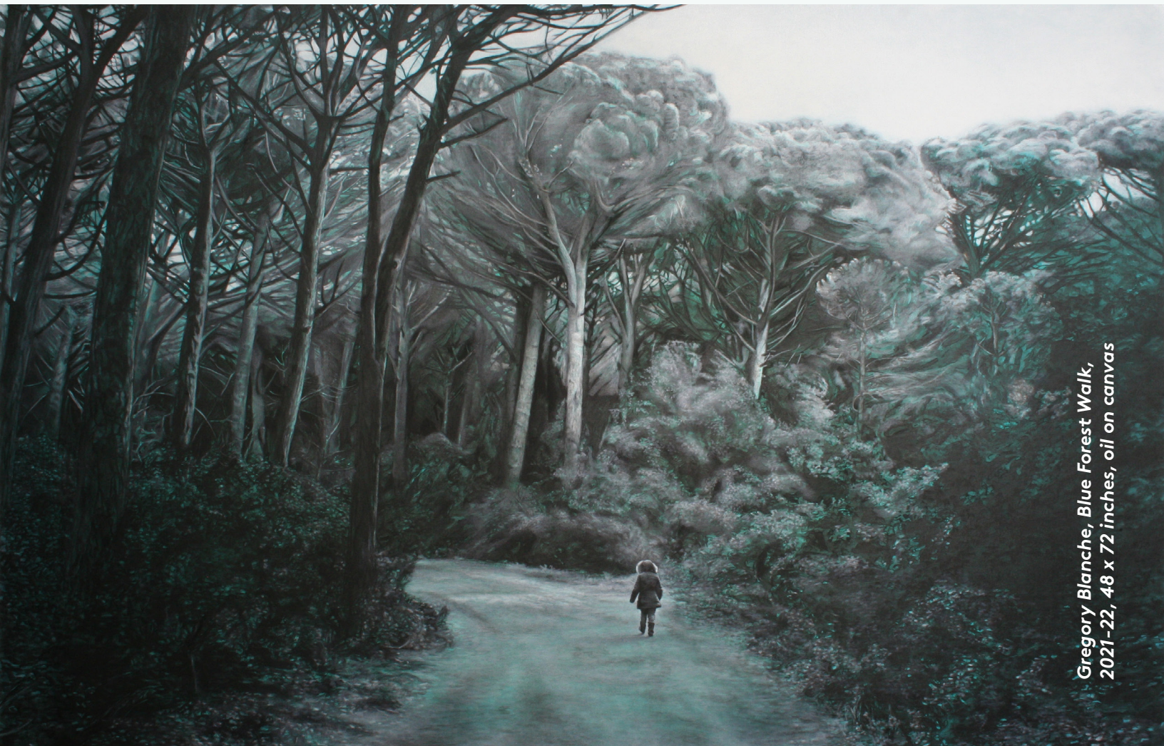
Gregory Blanche, Blue Forest Walk , 2021-22, 48 x 72 inches, oil on canvas

In the 2022 MFA show, he exhibited his graphite drawing Deposition , 2021. It depicts a dilapidated sofa that he felt had anthropomorphic qualities rendered elevated on a stepped formal pedestal. With a soft graphite texture, he builds a sharp yet hazy scene. The piece was inspired by a photograph he took of his couch upholstered in a gold and teal damask ripped with undyed cotton base fabric showing through. Blanche found the crumpled white drapes evoked something from another time, it was an object that suggested pity and vulnerability. He saw in this sofa a timeless sadness—in the form and lighting, he saw something very classical. In particular, it reminded him of the Michelangelo sculpture referred to as the Deposition or the Bandini Pietà , 1547 to 1555. Inspired by his years of living in Florence, Blanche chose to embark on a process of bringing anthropomorphic tendencies to life through the use of graphite.