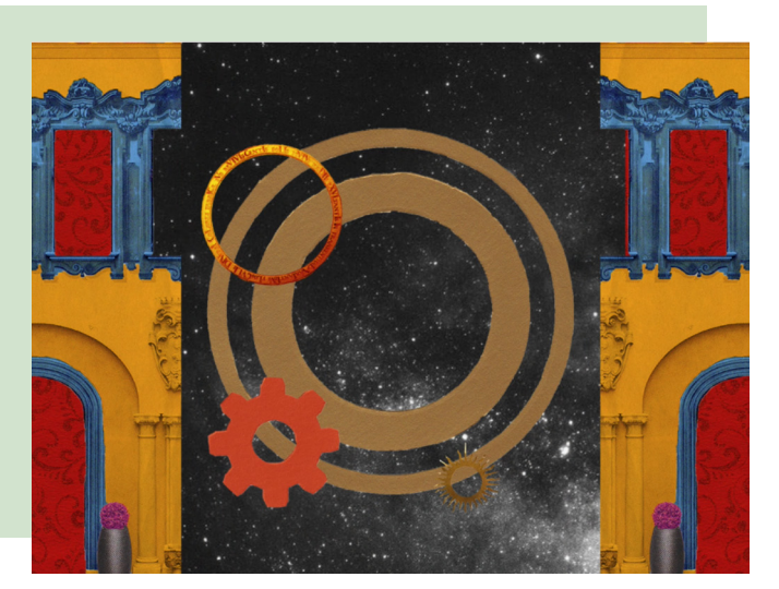
Still from Overture.

My thesis is a collection of work exploring fantastical scenes and landscapes in an imaginary world. These scenes are dream-like in nature and they are very materially-driven. I love drawing and I love getting hands-on in the studio. These images can end up getting pretty bizarre and immersive simply because there's so many ways to combine media and materials. I'm working towards creating a cohesive visual experience. I want people to feel immersed in my work as they navigate through my illustrations. It's really fun combining sci-fi and fantasy along with a lot of my historical influences!