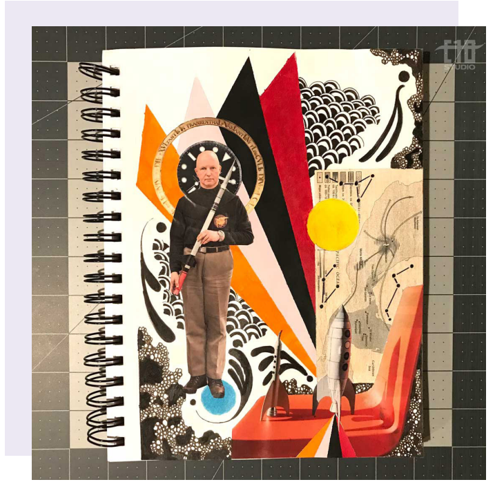
One Big Leap

Making things bigger and better. Literally. I've gotten so many comments over the years on how great it would be to scale up my work. It's something I've given a lot of thought to, and I'm slowly getting there. I have to consider where I'd store the work, but I'm in a better position storage-wise than I was even a month ago. I'm also working on honing my skills when it comes to drawing and choosing colors. Be on the lookout for more amazing things to come!