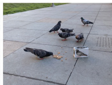
realism representation, 2021. Photos.