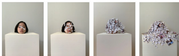
presentation and representation, 2021. Photos.