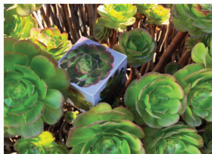
realism representation, 2021. Photos.

Yang Li: What has been the biggest influence on your work to date?