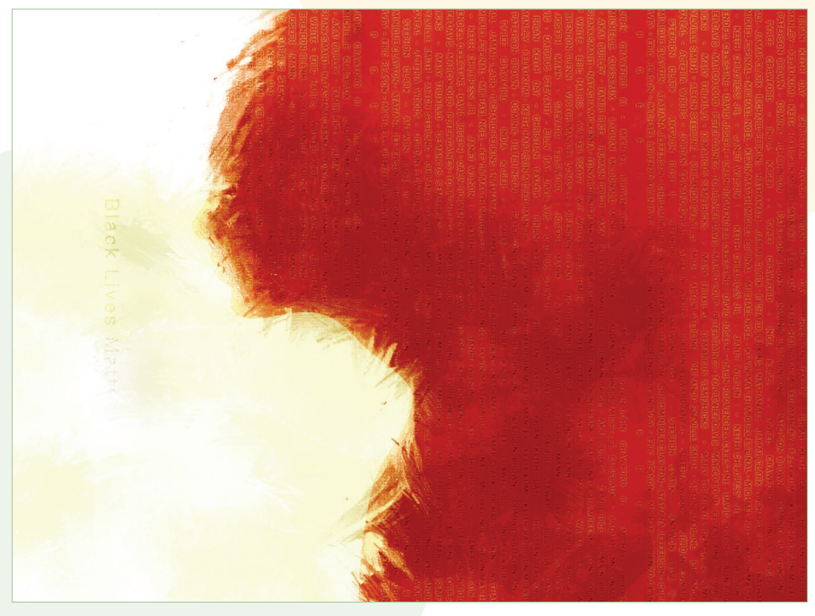
(do) black lives matter!