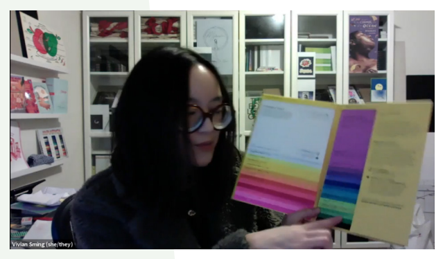
Sming showing a paper swatch sample book.

Leo Cantu: Do you have any recommendations for papers to ensure good color reproduction from photographs to print?