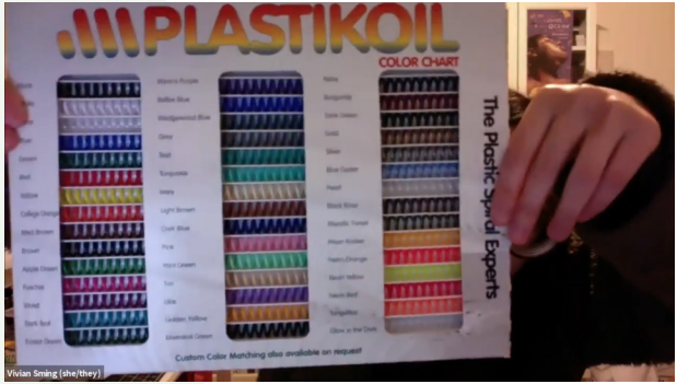
Sming holding up a long-arm stapler and coil bind samples.

Vivian Sming: A ruler, first of all. One thing that I've noticed myself doing recently is that I look at books for—I mean, this is terrible—but I like looking at books for their design, instead of reading the material. I'm always looking at the size of books, measuring the size. So a ruler is something that I will end up taking to my bedroom or dining table... or when folding sheets of paper, to get a sense of the dimensions of something.